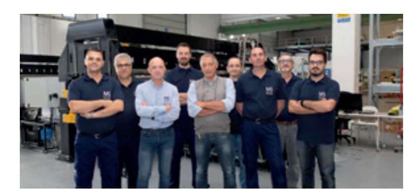
MS PRODUCTION TEAM LEADERS