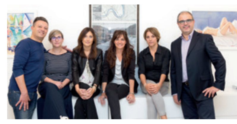
MS AND JK HR AND PURCHASING TEAM LEADERS

has allowed us to grow further with the reassurance of being able to act on our own initiative and free from undue limitations. We are a stand-alone company, even though we belong to a big company. The collaboration has also allowed us to keep the quality of our